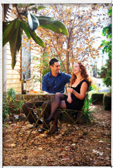
Alice's Cottages & Spa Hideaway