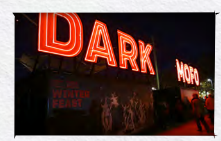
Winter Festival – Dark Mofo

and Barnbougle Lost Farm; Great Walks of Australia – with Tasmania having four of the seven products that make up the national program;