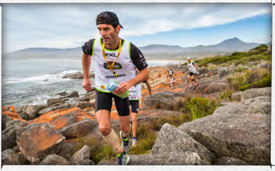
Mark Webber Challenge

In Japan, Japan Airlines launched its World of Beauty calendar for 2013 that featured imagery from Mt Field National Park for the month of November 2013. The calendar has been produced for over 40 years and is one of the most popular in Japan with over 1.25 million copies in distribution direct to consumers. Tasmania was last featured in 2004 with an image of the Richmond Bridge.