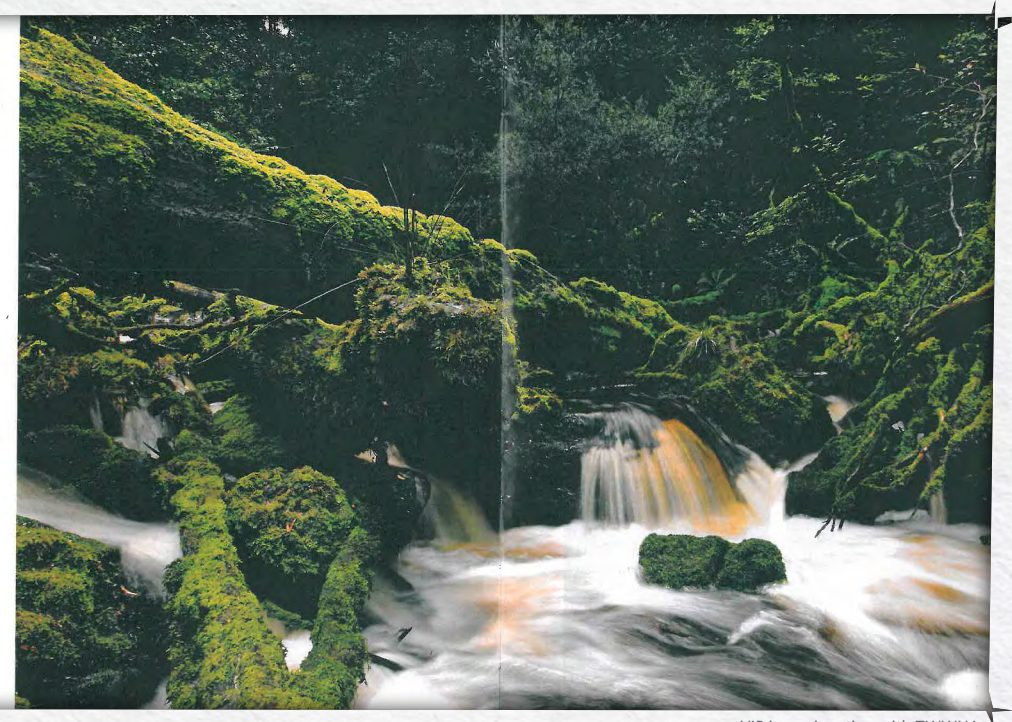
VJP in conjunction with TWWHA

Alse the journey into the Franklin-Gordon Rip National Park to raft along at least part Min'i 130km course in inflatable boars, a series valleys and over furious rapids. Devobid country can take 10 days to travel the head to where the Franklin meets the range to the mark of the way on nebble