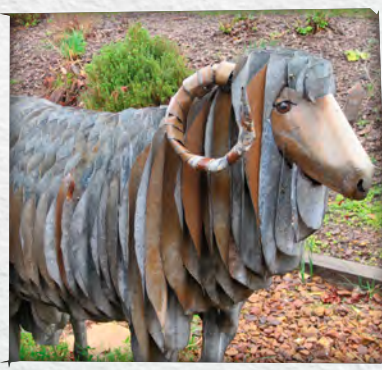
eaning Church Vineyard

The redevelopment by Tasports of Macquarie Wharf No 2 as a dedicated Cruise and Antarctic terminal will also help Tourism Tasmania target growth in the cruise ship market.